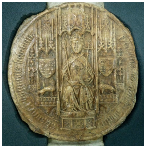
Plate 21 | Henry VII's great seal, which would have been attached to the actual letters patent given to John Cabot

Clues as to why Bristol supported Cabot can be found in the letters patent. While this was issued to the explorer, such grants could be assigned to others, in whole or part. In the same way that modern venture capitalists will buy shares in an enterprise from an entrepreneur who has a patent, Cabot could give away part of his rights to others in return for the money needed to fund his expeditions. In theory such investors could have come from anywhere. In practice, a clause in Cabot's grant made it particularly likely that Bristol's merchants and, indeed, the port's broader community, would support him. This clause was the stipulation that all ships operating under the patent should use the port of Bristol 'at which they are bound and holden only to arrive'. All future trade was to be conducted through Bristol. This made investment in the enterprise particularly attractive to the port's merchants. It would