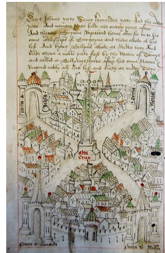
Plate 2 | Bristol's High Cross and city gates as depicted in its late-fifteenth century town chronicle (Bristol Record Office, MS 04720)

Fifteenth-century Bristol was England's leading provincial centre and the second port of the realm. By modern standards it was small, with a population of just eight thousand. Yet in a pre-industrial country of two million people, this was enough to make Bristol the regional hub for Somerset, Gloucestershire, South Wales and much of the West Midlands. The town itself was just a mile across: a visitor entering from the east on the London road could walk to the western shipyards in half-an-hour. In the process they would pass the Norman castle, the High Cross, the town's fine churches and the tall timber-framed houses of the port's great merchants. But what often impressed visitors most were the ships, glimpsed first down side alleys leading off the