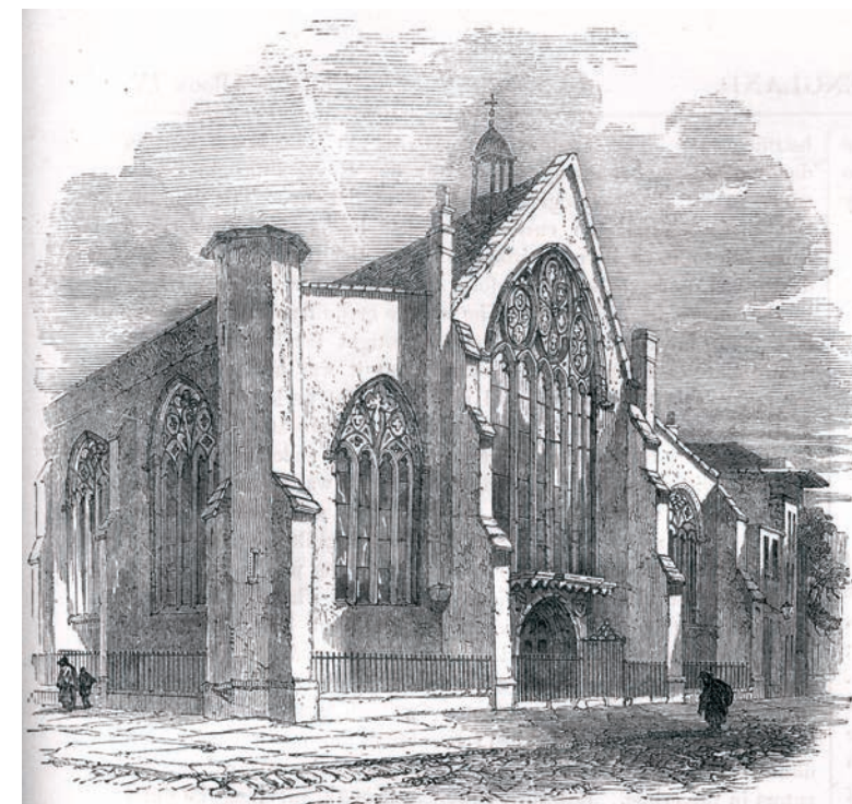
Plate 24 | Austin Friars, London. The friars ministered to London's Italian community, and Cabot may have lodged there. 6