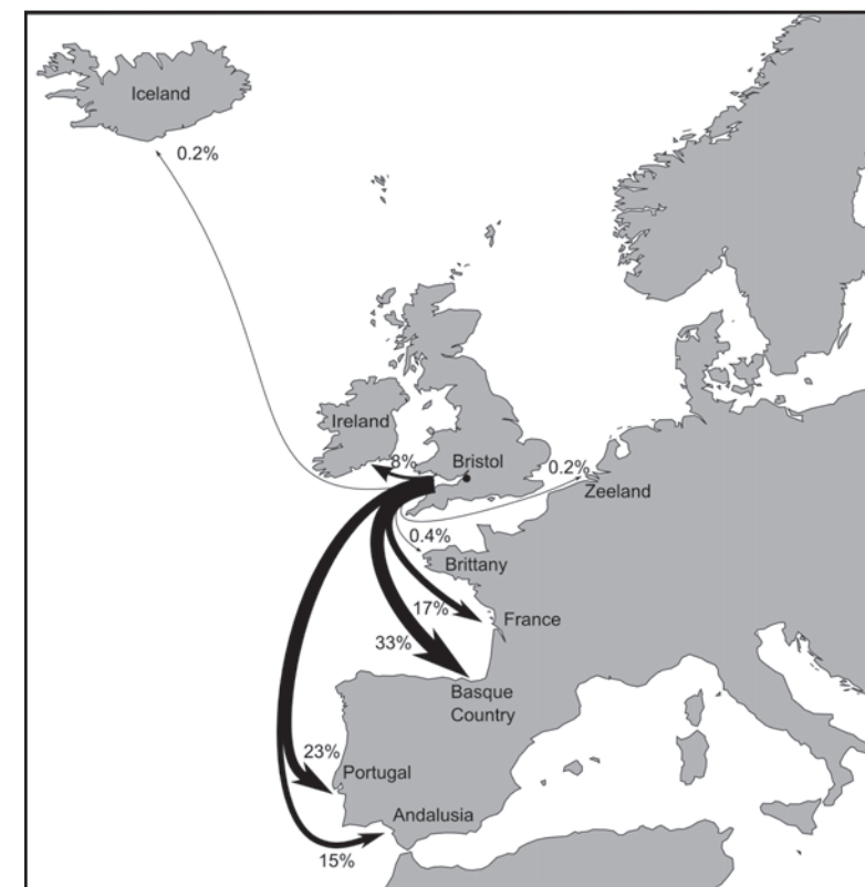
Fig 7 | Bristol's trade as recorded in the 1492/3 customs accounts 17

The decline of the Iceland trade has led some historians to suggest that the English were 'forced' out of Iceland by the Hanseatic League and that this prompted Bristol to go searching for a new source of fish to the west. 13 There are a number of problems with this theory. First, it ignores the fact that, throughout the fifteenth century, most of Bristol's fish came from southern Ireland. If Bristol needed more fish, the Irish trade could have been expanded. The second problem is that the English were not 'forced out' of Iceland during this period; Hull merchants, for example, continued to trade to Iceland until the end of the century. 14 Indeed, the English fishery off Iceland actually grew in the late-fifteenth century and on into the sixteenth century. By the 1530s it was one of England's most important fisheries, with up to 130 ships sailing there annually. 15 It is just that nearly all of