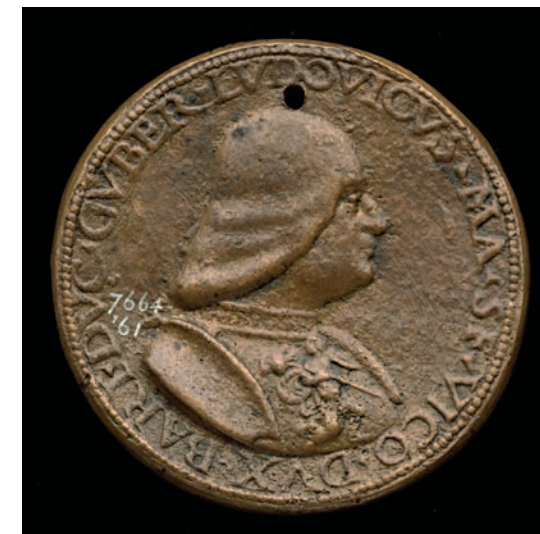
Plate 22 | Ludovico Maria Sforza, Duke of Milan. His ambassador's letters home are an important source of information concerning John Cabot. 3

de Raimondi de Soncino, the Milanese ambassador to England. Soncino's letter to his master, the Duke of Milan, discusses both the voyage undertaken by Cabot the previous summer and the one planned for 1498. 2 The ambassador, who had no reason for exaggerating Bristol's importance, noted that when Cabot returned four months earlier, he would not, as a 'foreigner and a poor man' have been believed at Court 'had it not been that his companions, who are practically all English and from Bristol, testified that he spoke the truth'. Soncino then went on to say of the plans for the 1498 voyage that 'the leading men in this enterprise are from Bristol, and great seamen.'