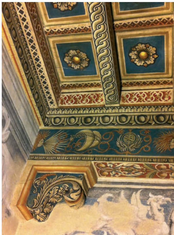
Plate 25 | Late fifteenth-century decoration of a beam and ceiling in the Bardi's house in Florence. It includes a frieze of nautical imagery